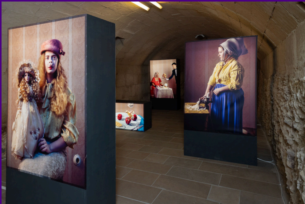
Installation view, Kukbuk, KORA.