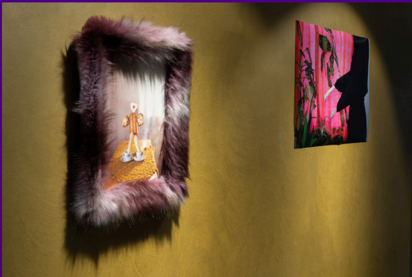
PIInstallation view, Corpus Luxuria , Galerie Černá labuť.