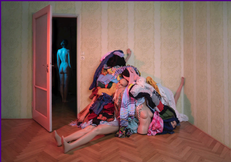
Eve Returning to Paradise, Photography, 2019.