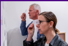
Installation view, Kukbuk, Teleport Gallery .