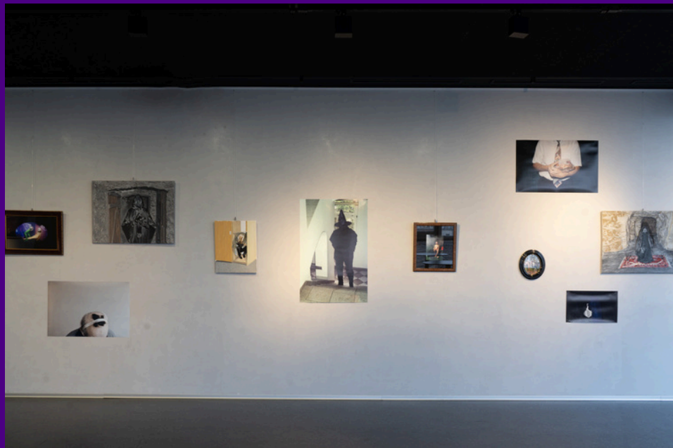
Installation view, Corpus Luxuria , Galerie Černá labuť.