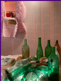
Installation view, Festival Pokoje.