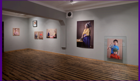
Installation view, Kukbuk, Fiducia.