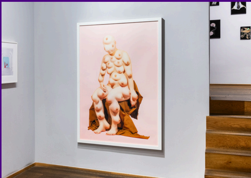
Installation view, Sister of a Sister of a Sister , Leica Gallery.