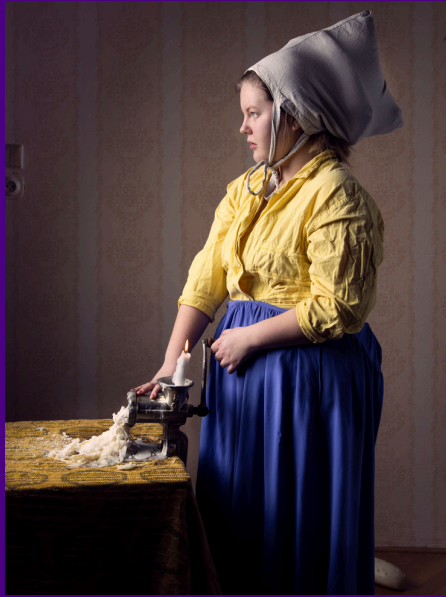
Candle Sauce, photography, 2020.