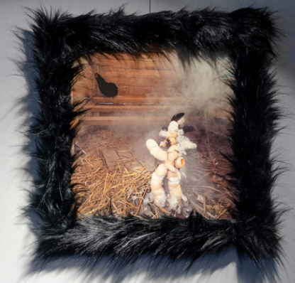
Installation view, Corpus Luxuria , Galerie Černá labuť.