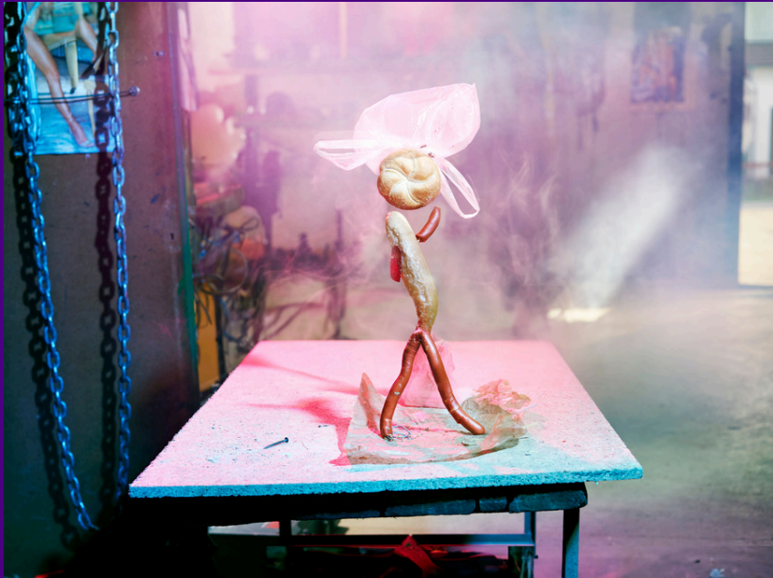
Waltzing with Wieners, photography, 2024.