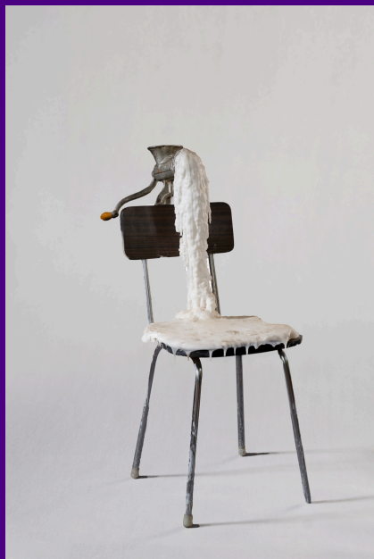
Pomník nejmenované závodní kuchačce, objekt, 2023.